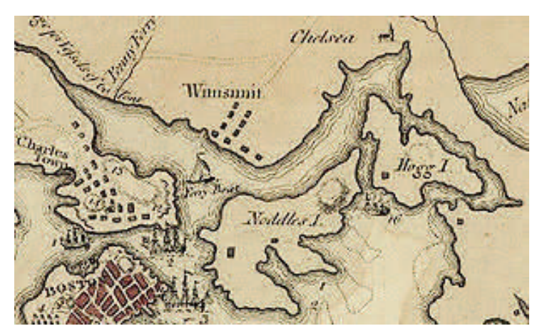
MAP #1 - Map circa 1775/76 shows the Chelsea River running above Noddle's Island and Hogg Island. To left is Charles Town, and the City of Boston is at lower left. Note black mark between Noddles Island and Hogg Island. It is enlarged below and shows there is a picture of a ship and the number "16".

http://en.wikipedia.org/wiki/ List of American Revolutionary War battles