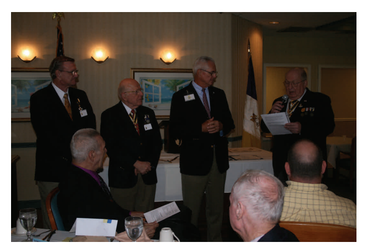
South Shores SAR Chapter Chartering Ceremony

If you believe you qualify for the Vietnam War Veterans Corps, or any of the other NSSAR Corps, send an email request for a survey email arequest of a survey form VetCorps@sar.org.