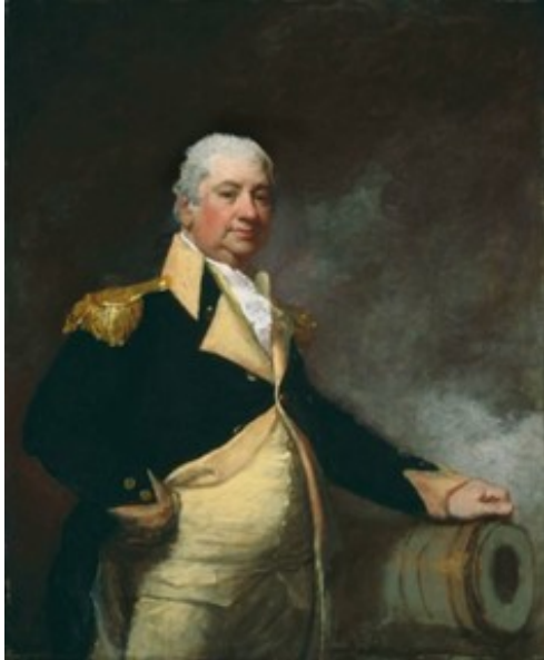
General Gage by Gilbert Steward

On this day in history, July 25, 1750, General Henry Knox is born. Knox was one of George Washington's key leaders over the Continental Army and one of his most trusted advisers. Henry Knox was born in Massachusetts and was a member of the militia from the age of 18. Knox apprenticed in a bookstore and eventually opened his own bookstore, the "London Bookstore," in Boston. He used his proximity to books to train himself in the art of war, especially artillery and engineering. Knox observed the Boston Massacre and tried to encourage the soldiers involved to go back to their barracks before any violence occurred. He also testified in the trial of the soldiers. He became involved in the Sons of Liberty in Boston and was a sentry guarding the tea ships from unloading during the Boston Tea Party crisis.