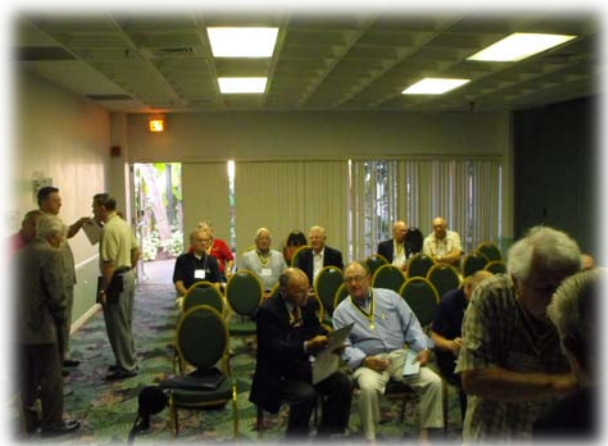
Figure 4: Saturday morning session crowd.