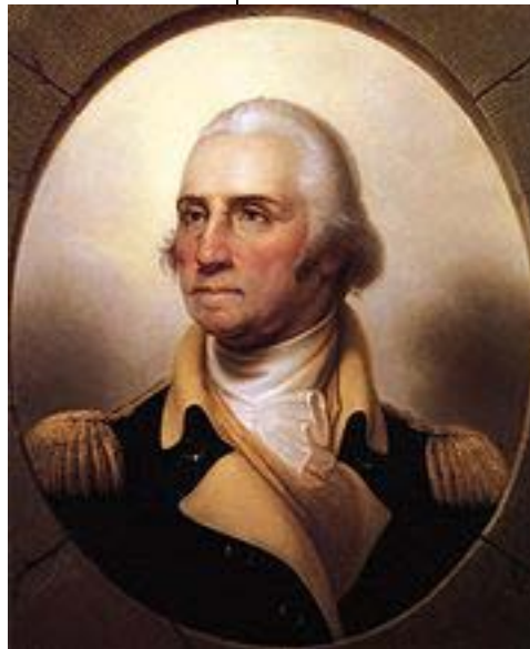
Figure 2: Portrait of George Washington in military uniform, painted by Rembrandt Peale

http://en.wikipedia.org/wiki/George_Washington