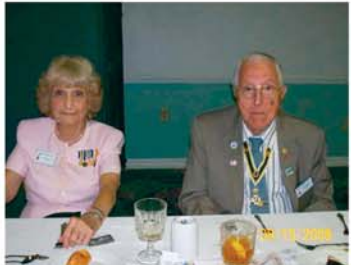
The Florida Patriot