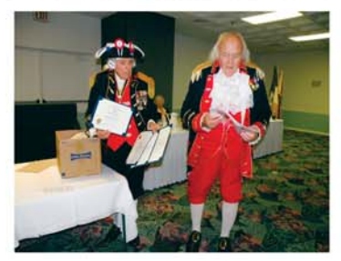
The Florida Patriot