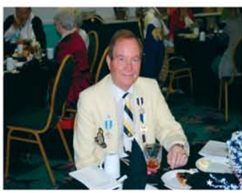
The Florida Patriot