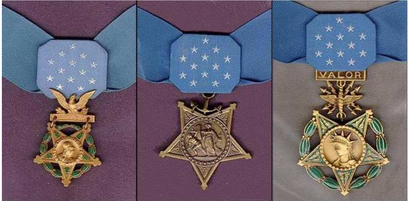
From left to right, the Army, Navy/Marine Corps and Air Force medals