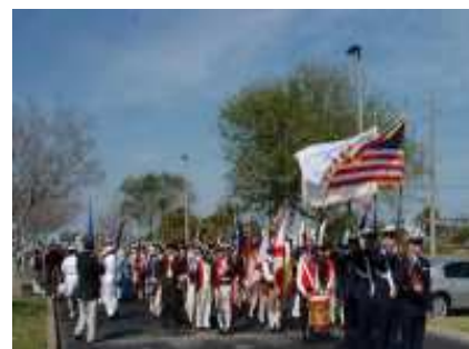
Coast Guard Color Guard Leads a Parade of 200 People