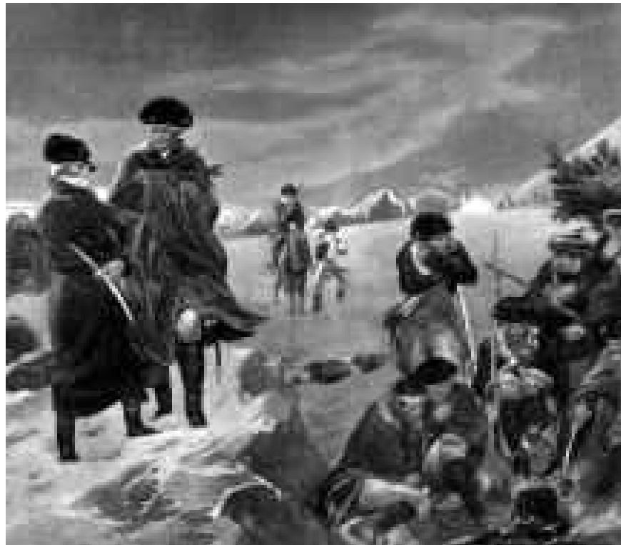
Washington At Valley Forge (See page 4)

Also in this issue Minutes of the Fall BOM meeting Chapter News