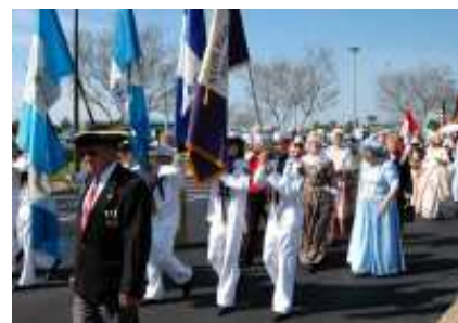
Daughters of the American Revolution Featuring Ladies In Colonial Dress