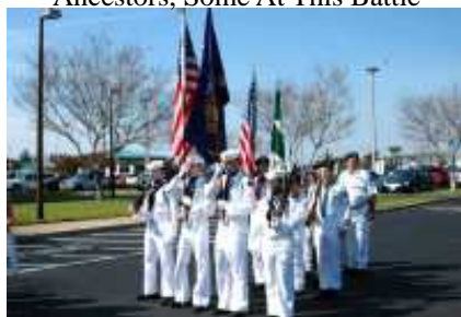
A Local Unit of Sea Cadets