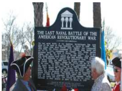
Official State of Florida Marker Dedicated On This Date

Cape Canaveral, Florida - March 10, 2007