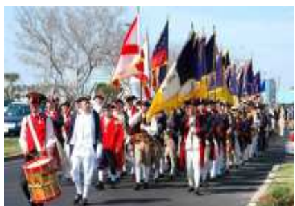
Florida Society Color Guard With 7 Other State Color Guards Florida Society Organized This Event.