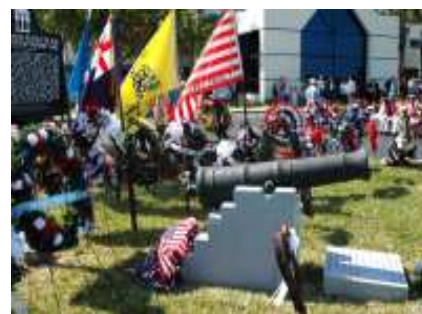
The Thirty-five wreaths Presented and Many Flags Made a Colorful Setting for the Marker and Cannon