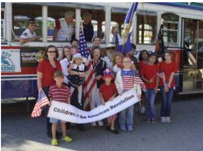
Children of the American Revolution and DAR Members by the SAR Trolley before the parade starts.