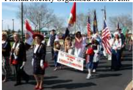
Children of the American Revolution Honor Their Patriot Ancestors