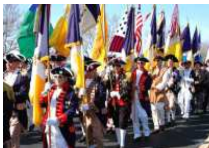
The Seventy Color Guardsmen Represent Hundreds of Patriot Ancestors, Some At This Battle