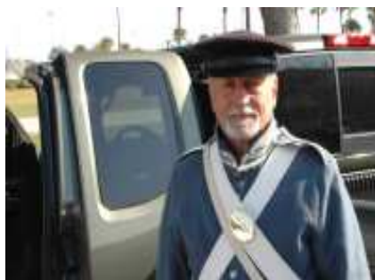
Charles de Leusomme 1783 French Uniform