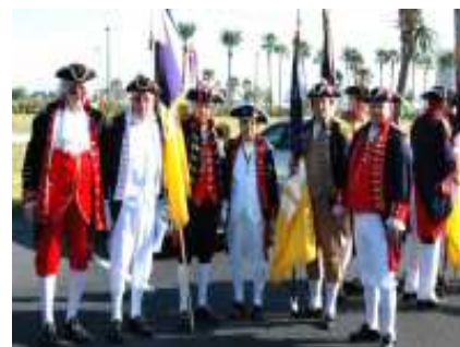
St. Lucie River Chapter Compatriots