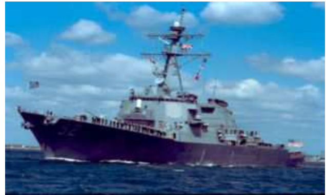
Guided Missile Destroyer USS Barry (DDG52)