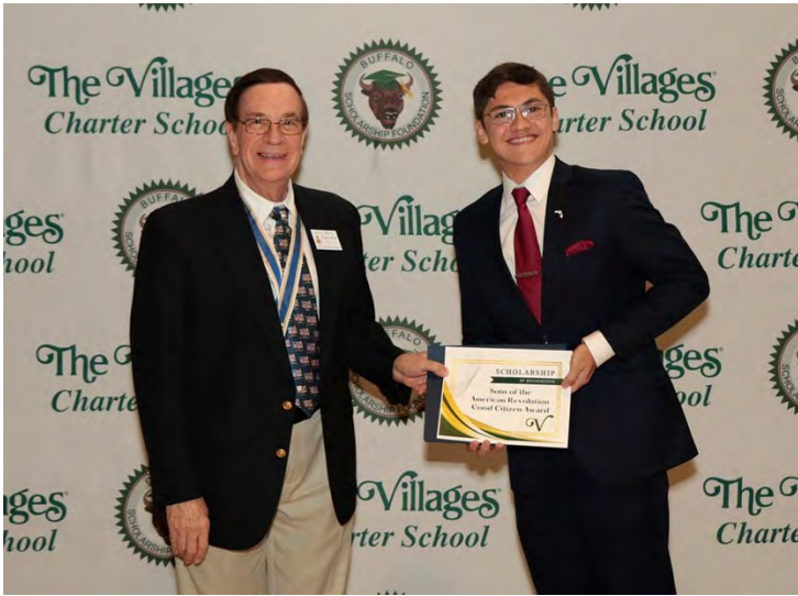
Gold (a Naval Aviation group in the Villages) members and their families to place Memorial Day flags in section 402 of the Florida National Cemetery in Bushnell.