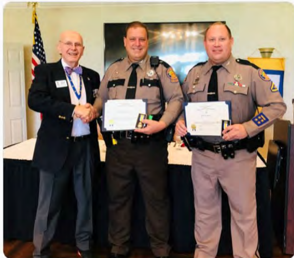
FLHSMV and MADD FLORIDA

FHP Tampa @FHPTampa · 34m FHP Troopers assigned to Pinellas County honored this week by the Clearwater Chapter of the S.A.R. for interdicting an impaired wrong-way driver in July on Park Street.