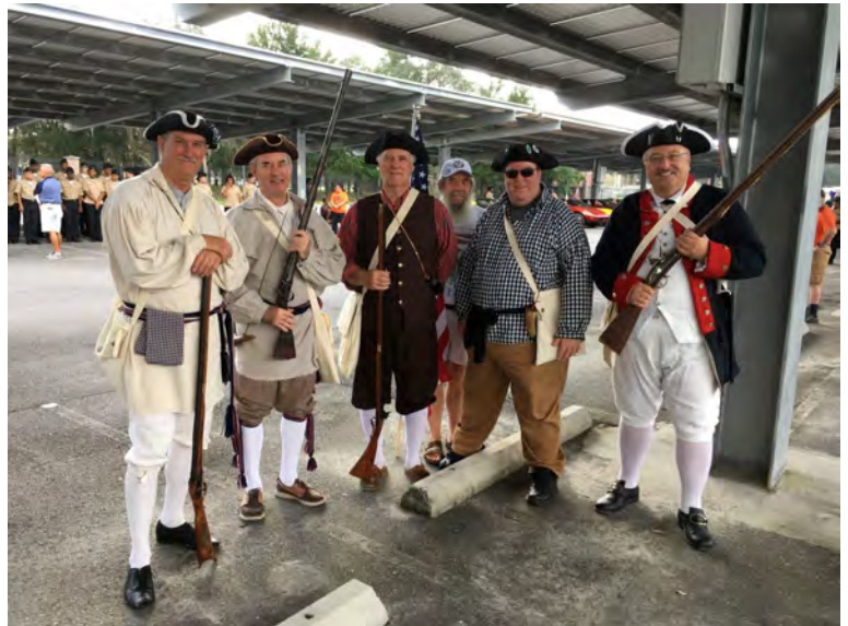
The Veterans Day participants at Bay Pines.