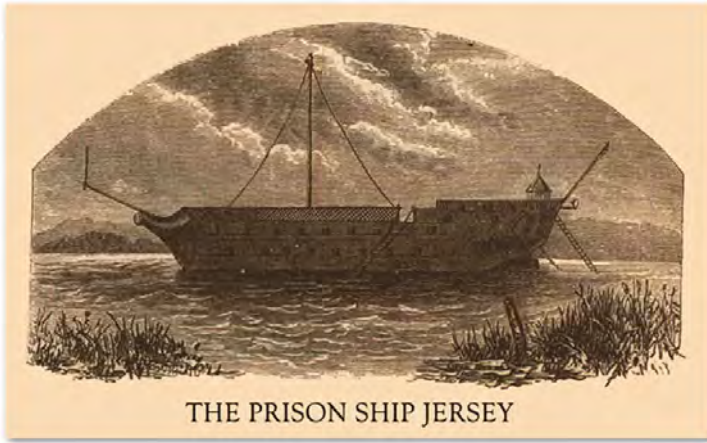
THE PRISON SHIP JERSEY