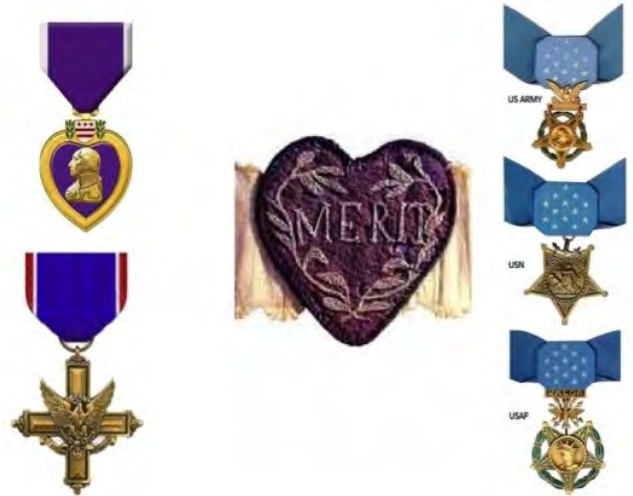
United States of America Medals of Merit

Washington statement regarding the Badge of Military