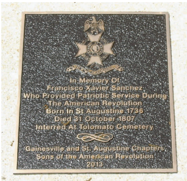
Dedication Plaque provide by the Gainesville SAR Chapter and the St. Augustine SAR Chapter