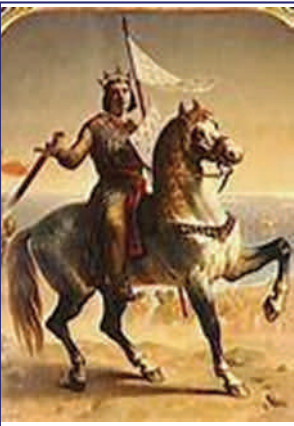
Louis IX, saint, crusader and king of France (1226–70), son and successor of Louis VIII. His mother, Blanche of Castile , was regent during his minority (1226–34), and her regency probably lasted even after Louis reached his majority; she was his chief adviser until her death.