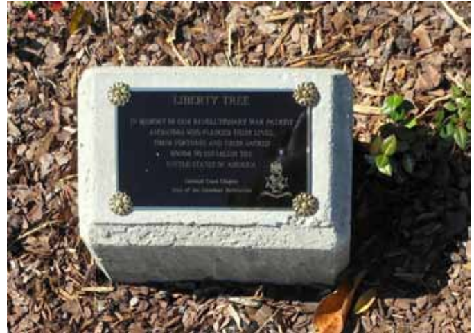
The Emerald Coast Chapter presented a Liberty Tree at the opening and dedication ceremony of the recently completed Okaloosa County Court House Annex.