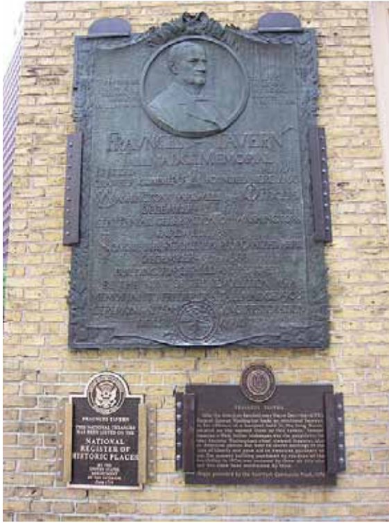
Plaque at Fraunces Tavern, 54 Pearl Street, Manhattan, New York.