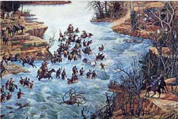
Battle at Cowan's Ford - 1781

This dramatic painting is one of several at the George Rogers Clark National Historical Park in Vincennes, Indiana that depicts the life of Patriot Clark. Here he is accepting the surrender of Fort Sackville from Colonel Henry Hamilton. - 1779