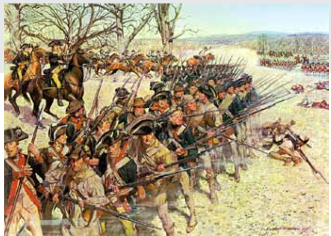
Battle at Guilford Courthouse - 1781