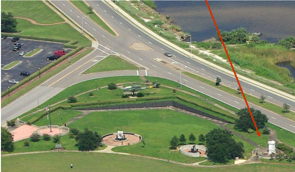
Aerial Photo by Earl Caudell 02 Sep 2010